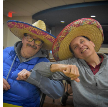
The Evening Stars "Taco Night" was a success!